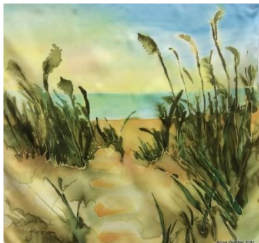
St. Simon's Island

August 31-November 30, Small Works , St. Mark's; November 30-March 2, 2019, Rio Grande Art Association, St. Mark's